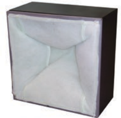
General Purpose Filter & Housing