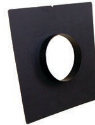
12" Vacuum Intake (Used for Duct Cleaning)