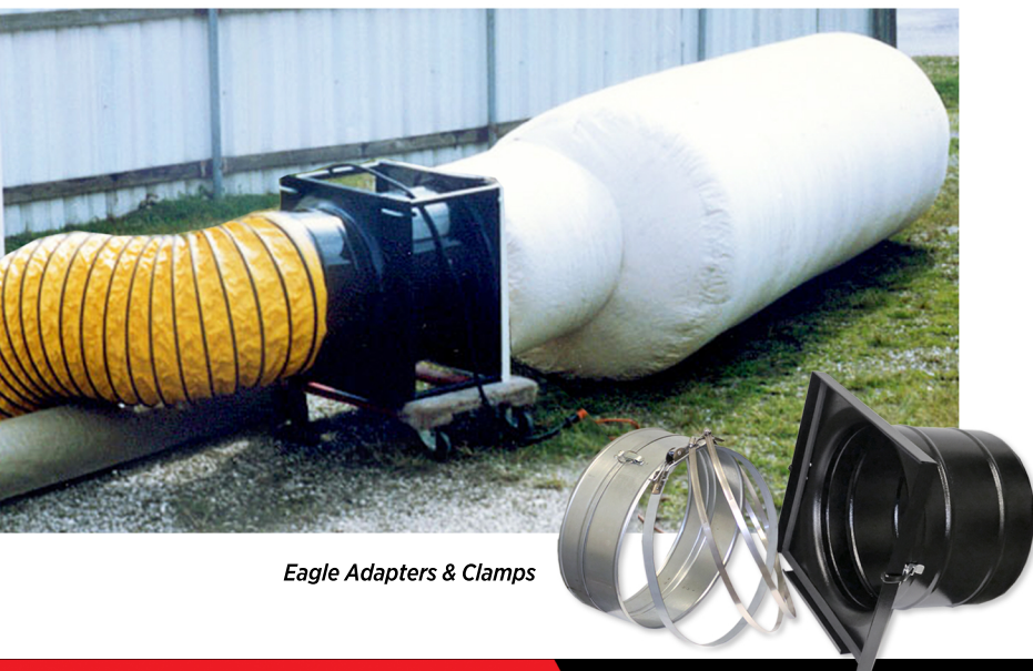
Eagle Adapters & Clamps